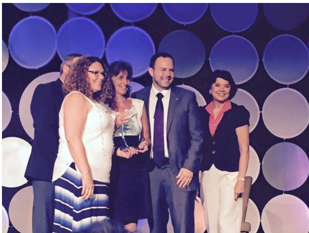
Outstanding Performance by a Local Section – Medium Size Category Award