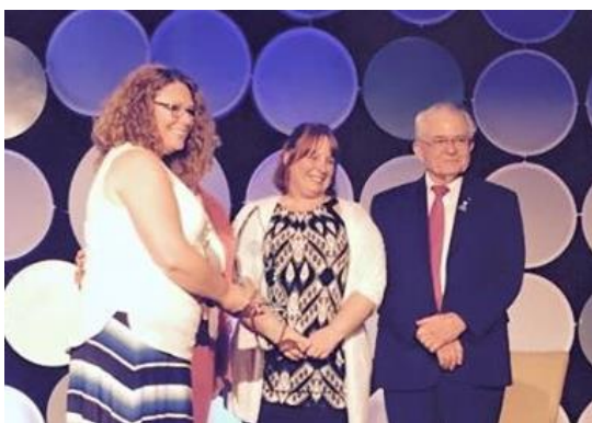
Best Event or Activity Organized by, or Benefiting, the Applied Chemical Technology Professional Community