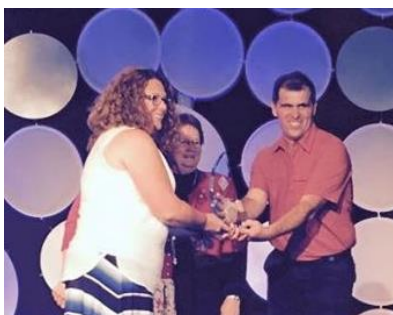
Fostering Interactions Between Local Sections & Student Chapters